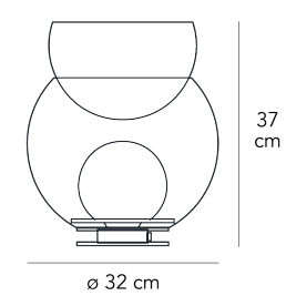
Table lamp with diffused light not dimmable. Chromed metal frame. Middle globe made of transparent blown glass. Inner globe made of glossy white blown glass. Top half-sphere made of trasparent and coloured blown glass with decorative bubbles. Black power cable, switch and plug. European two-pole plug. Bulb not included.

Half vase, half lamp, Giova marks the debut of Gae Aulenti in the field of lighting design. Available in two sizes, it is both a lamp and a luminous sculpture. Positioned on a metal base is a transparent bowl containing a sphere, which in turn houses the light source. Placed above is a smaller bowl in blown pulegoso glass, meaning 'with irregular bubbles', which serves as a bottom vase.