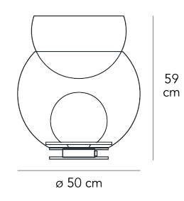
Table lamp with diffused light not dimmable. Chromed metal frame. Middle globe made of transparent blown glass. Inner globe made of glossy white blown glass. Top half-sphere made of transparent and coloured blown glass with decorative bubbles. Black power cable, switch and plug. European two-pole plug. Bulb not included.

Half vase, half lamp, Giova marks the debut of Gae Aulenti in the field of lighting design. Available in two sizes, it is both a lamp and a luminous sculpture. Positioned on a metal base is a transparent bowl containing a sphere, which in turn houses the light source. Placed above is a smaller bowl in blown pulegoso glass, meaning 'with irregular bubbles', which serves as a bottom vase.