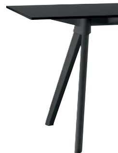
Frame: Natural beech Joint: White 1735 C Top: White 8500