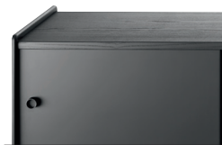
Frame: Anodised Black Aluminium Top: Stained Black Ash or MDF veneered Black Ash