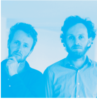
Ronan & Erwan Bouroullec

Ronan and Erwan Bouroullec have been working together for about ten years now. Their collaboration is a permanent dialogue, nourished by their distinct personalities and a shared notion of diligence, with the intention to achieve greater balance and refinement. The Bouroullecs have been working with Magis since 2004, designing two complete furniture collections as well as other projects. These days, Ronan and Erwan Bouroullec design for numerous manufacturers and they also continue to carry out their own experimental activity which is essential to the development of their work at Galerie Kreo, Paris, where four exhibitions of their designs