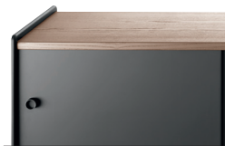
Frame: Anodised Black Aluminium Top: Natural Walnut or MDF veneered Natural Walnut