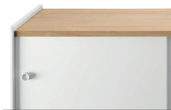
Frame: Anodised Aluminium Top: Natural Cherry or MDF veneered Natural Cherry