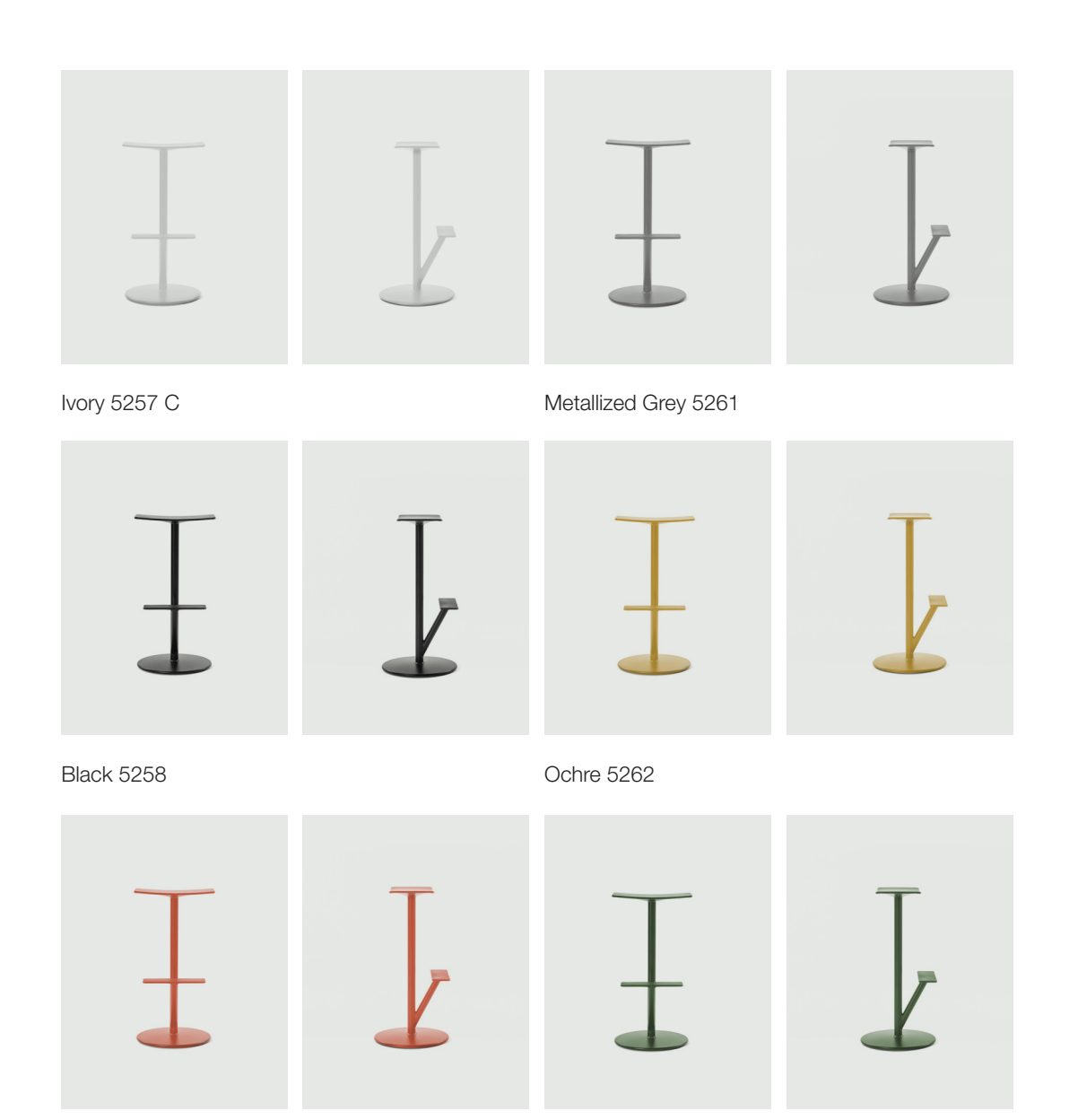
Coral Red 5259 Dark Green 5260