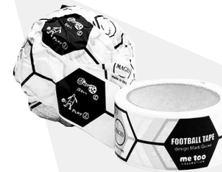
White 1735 C