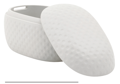
Matt colour White 1700 C