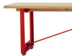
Indoor use Seat: Natural Oak Frame: Red 5143