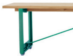
Indoor use Seat: Natural Oak Frame: Green 5126