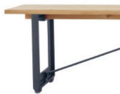
Indoor use Seat: Natural Oak Frame: Anthracite Grey 5142