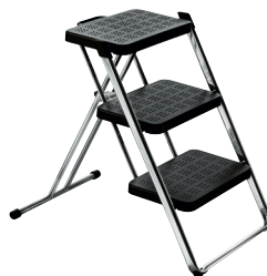
Finishes Frame: Chromed Steps: Black 1750 C