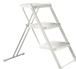
Finishes Frame: White Steps: White