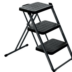
Finishes Frame: Black 5020 Steps: Black 1750 C