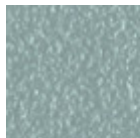
Light blue steel