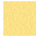
Pastel yellow steel