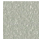
Light grey steel